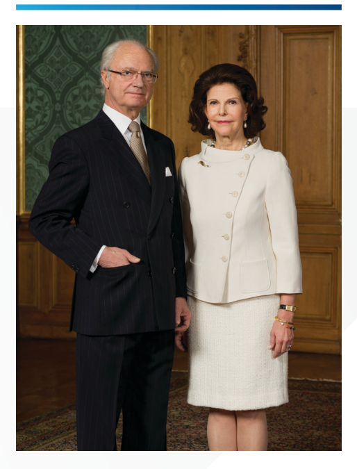
THEIR MAJESTIES KING CARL XVI GUSTAF AND QUEEN SILVIA OF SWEDEN

Swedish Business Delegation to Latvia, March 26–27, 2014 In conjunction with the State Visit of Their Majesties the King and the Queen of Sweden